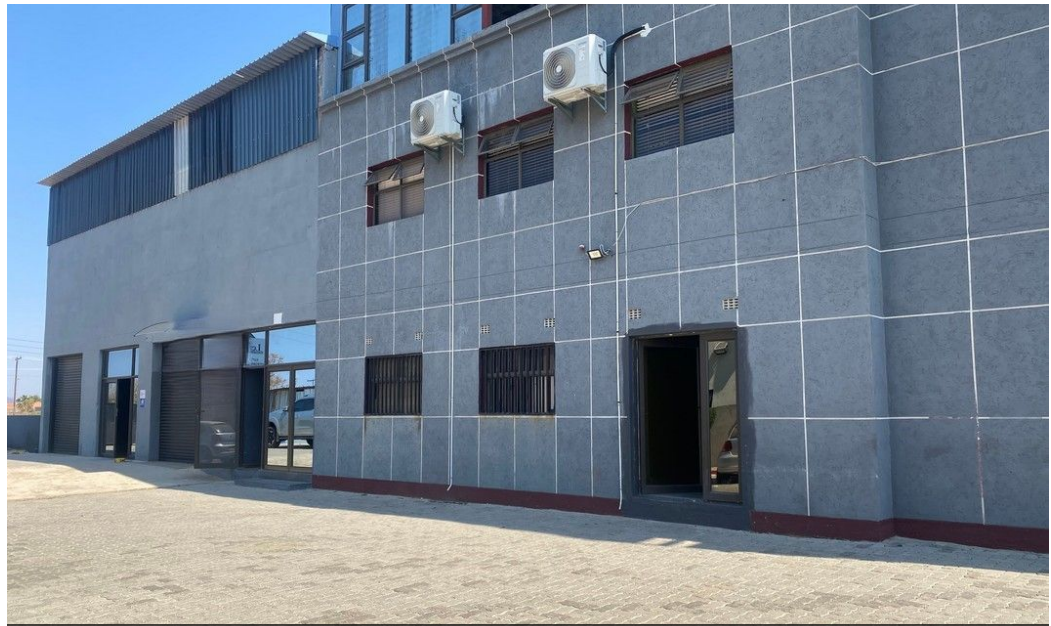
Web Ref CJM911