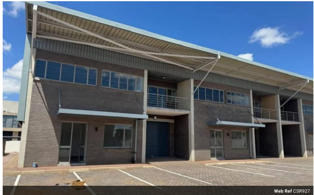
Web Ref CSR927