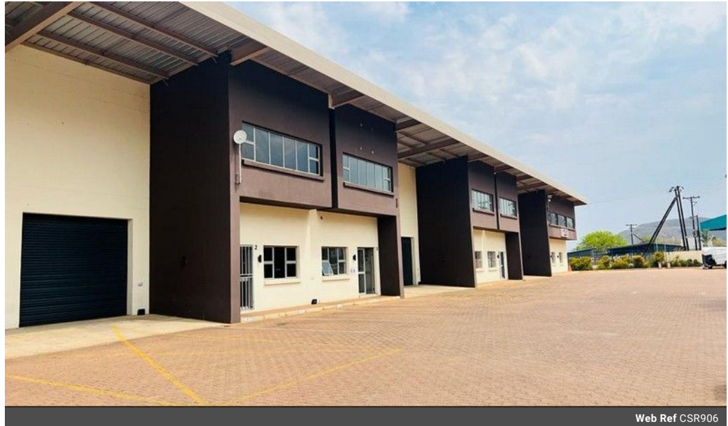
Web Ref CSR906