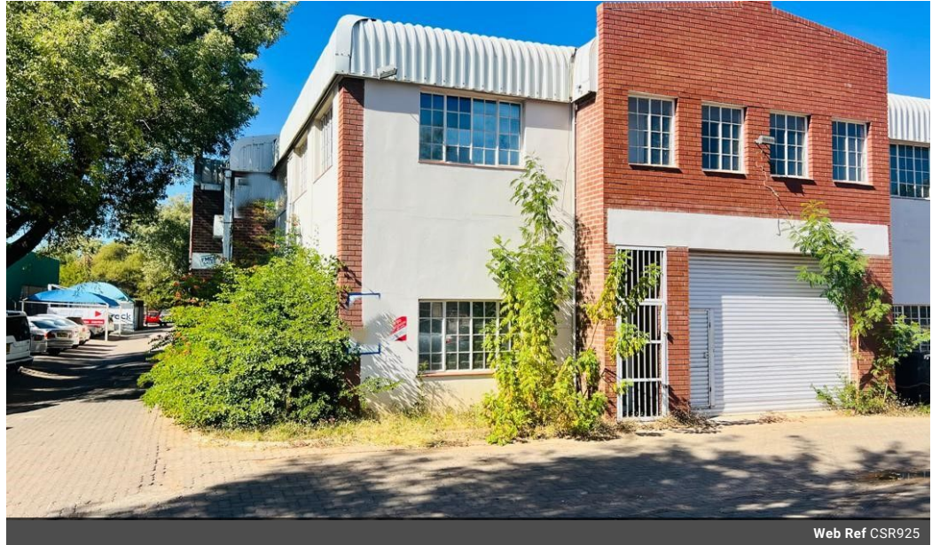
Web Ref CSR925