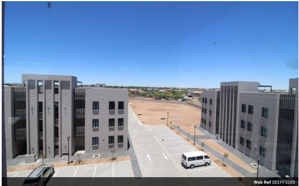
Web Ref SEEFF5280