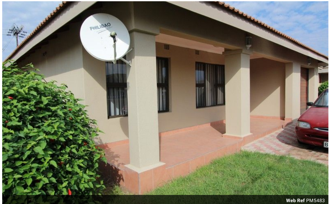
Web Ref PM5483