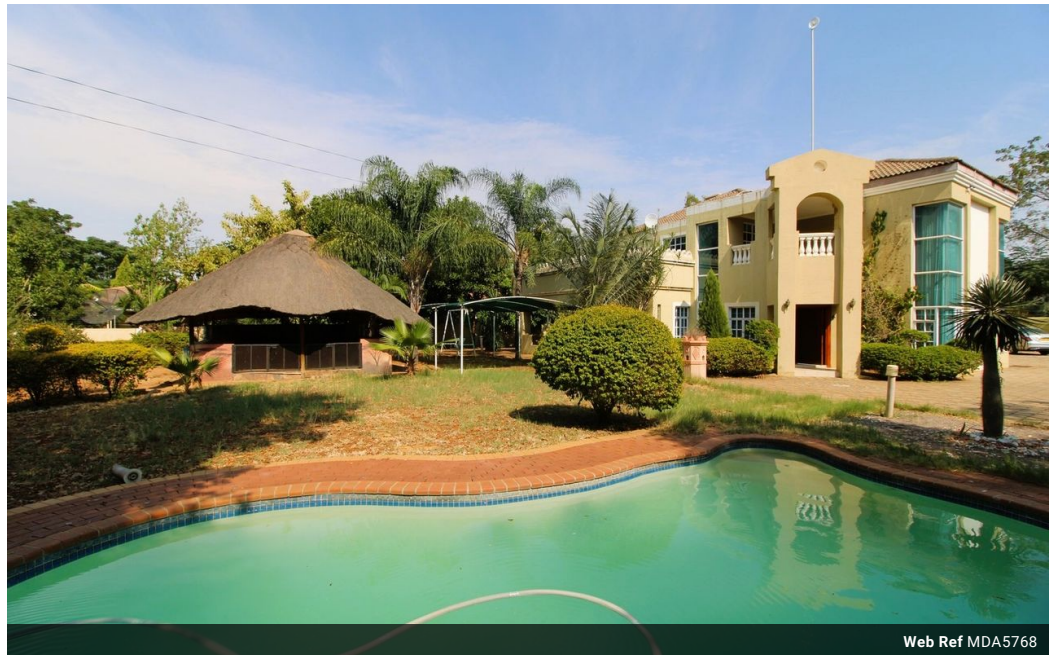
Web Ref MDA5768