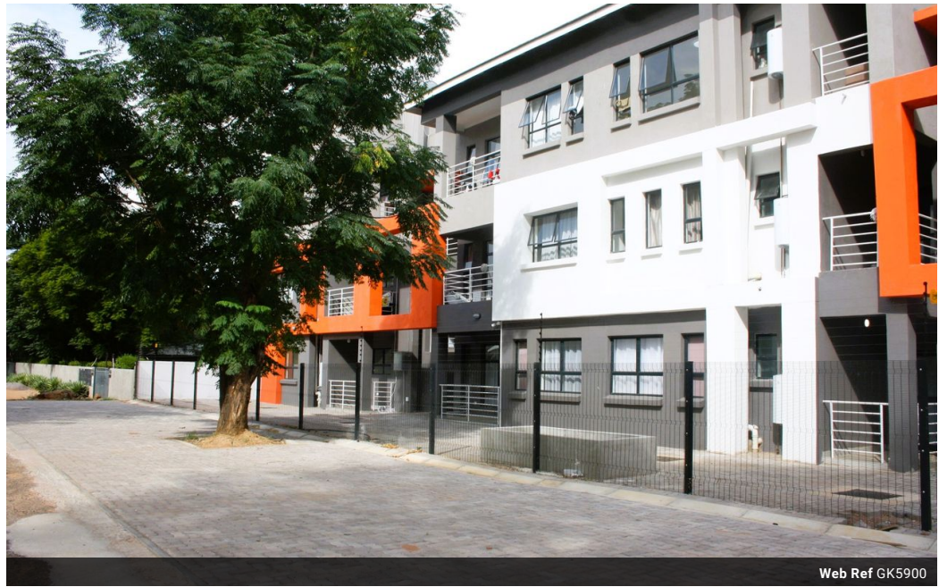
Web Ref GK5900