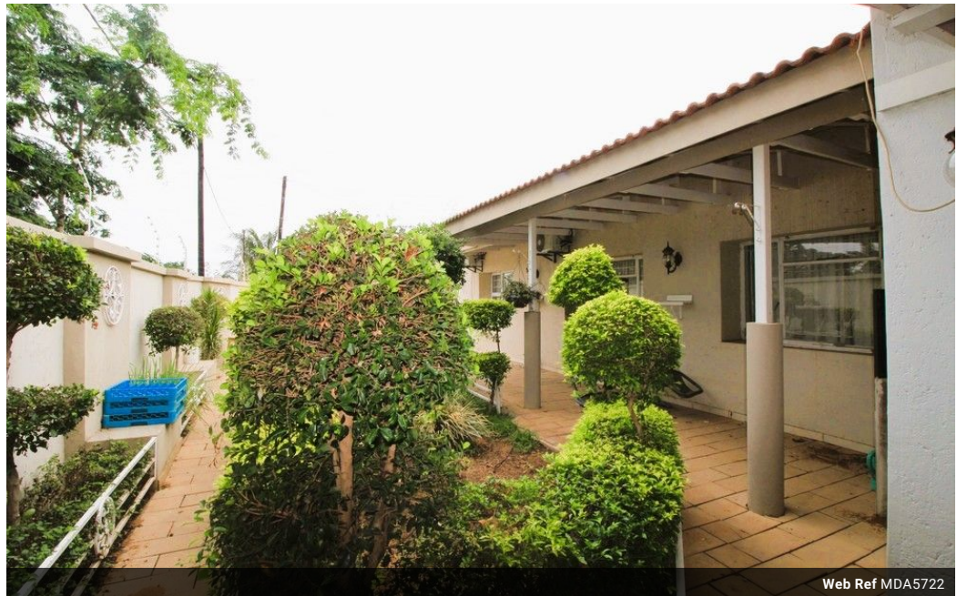
Web Ref MDA5722