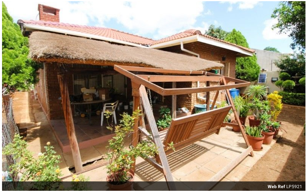
Web Ref LP5921