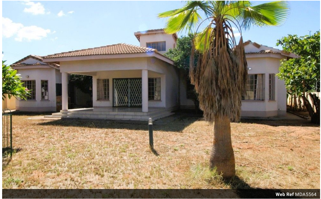
Web Ref MDA5564