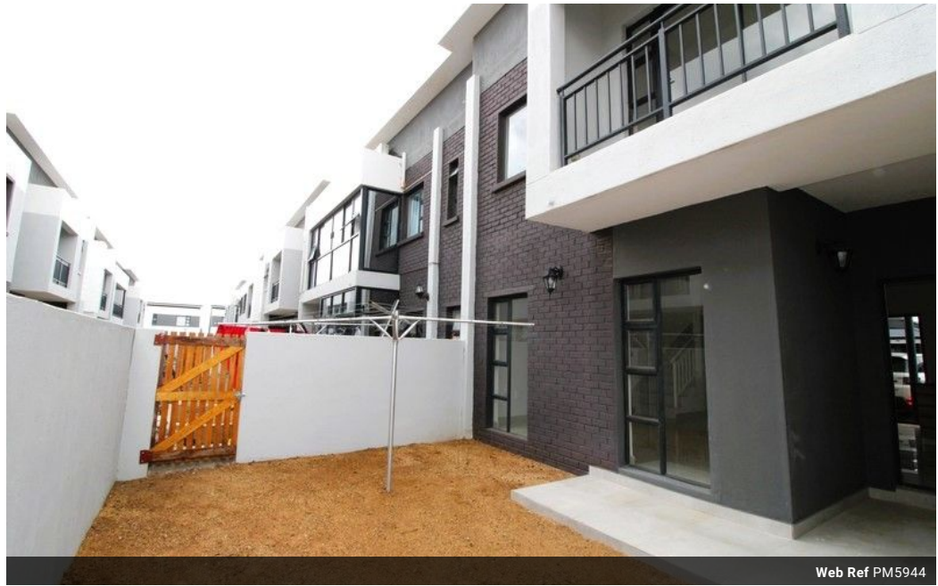
Web Ref PM5944