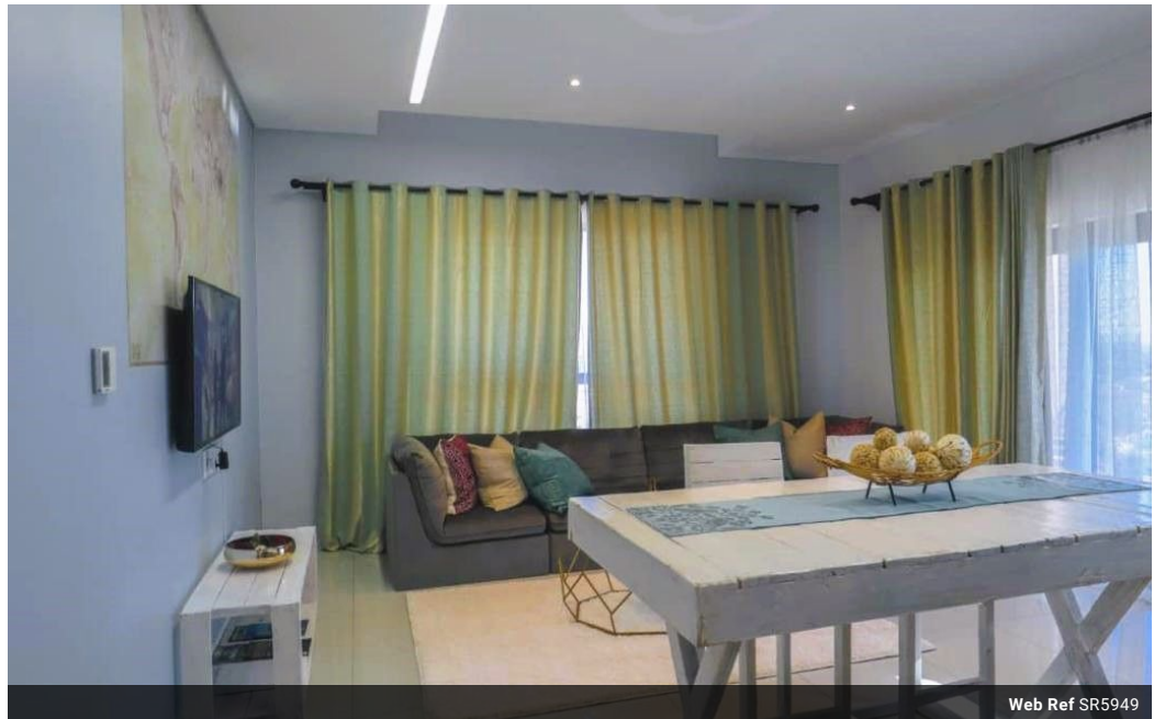
Web Ref SR5949