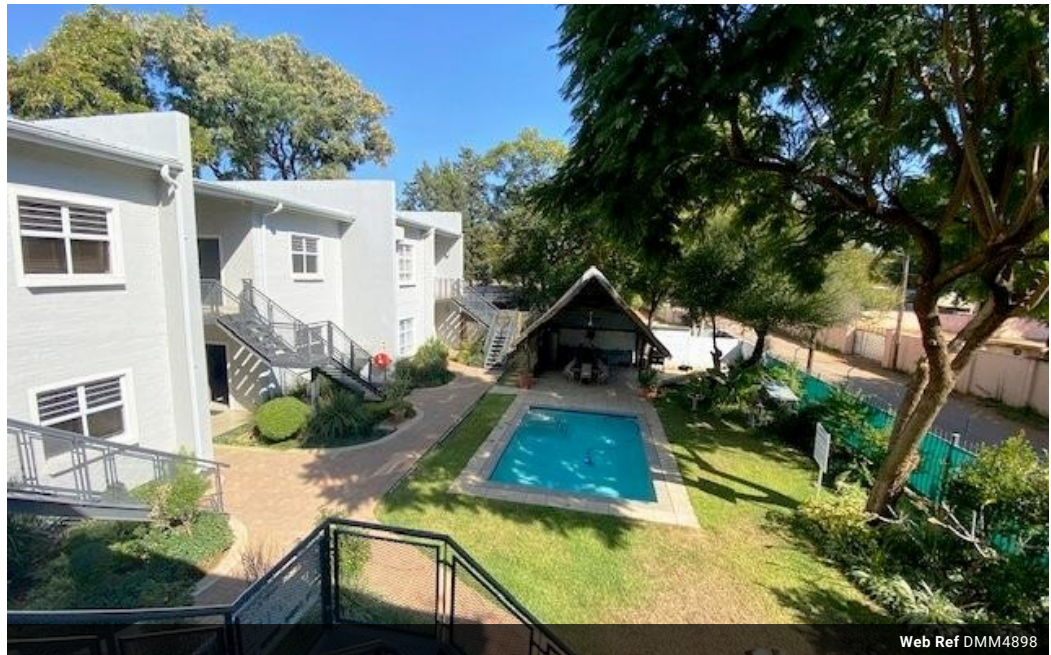
Web Ref DMM4898