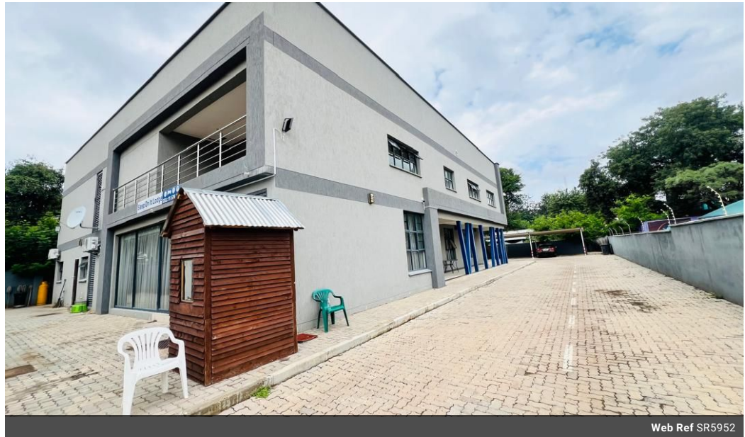
Web Ref SR5952