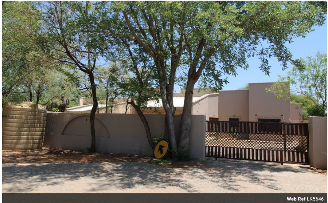
Web Ref LK5646