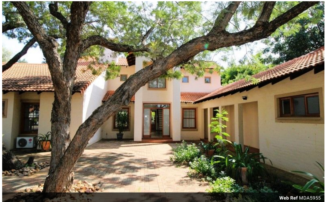
Web Ref MDA5955