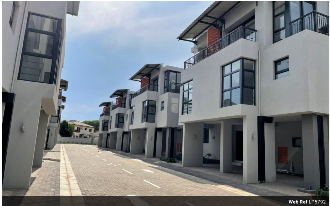
Web Ref LP5792