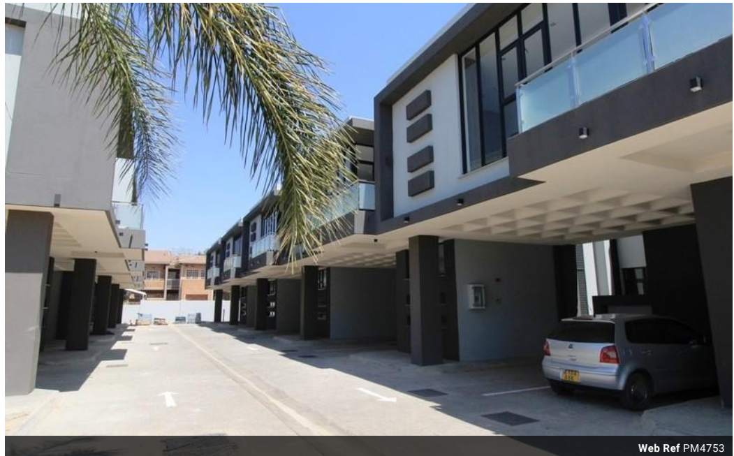
Web Ref PM4753