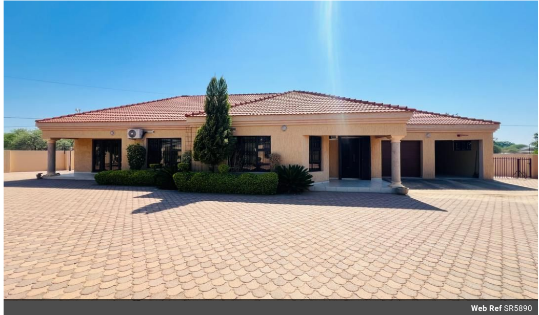
Web Ref SR5890